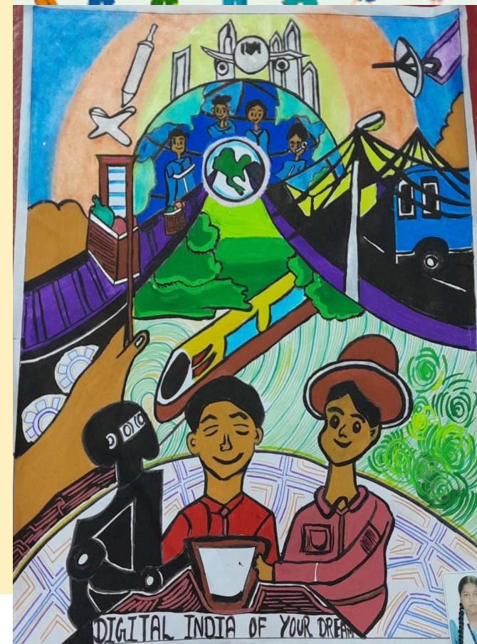
Suman XI Humanities