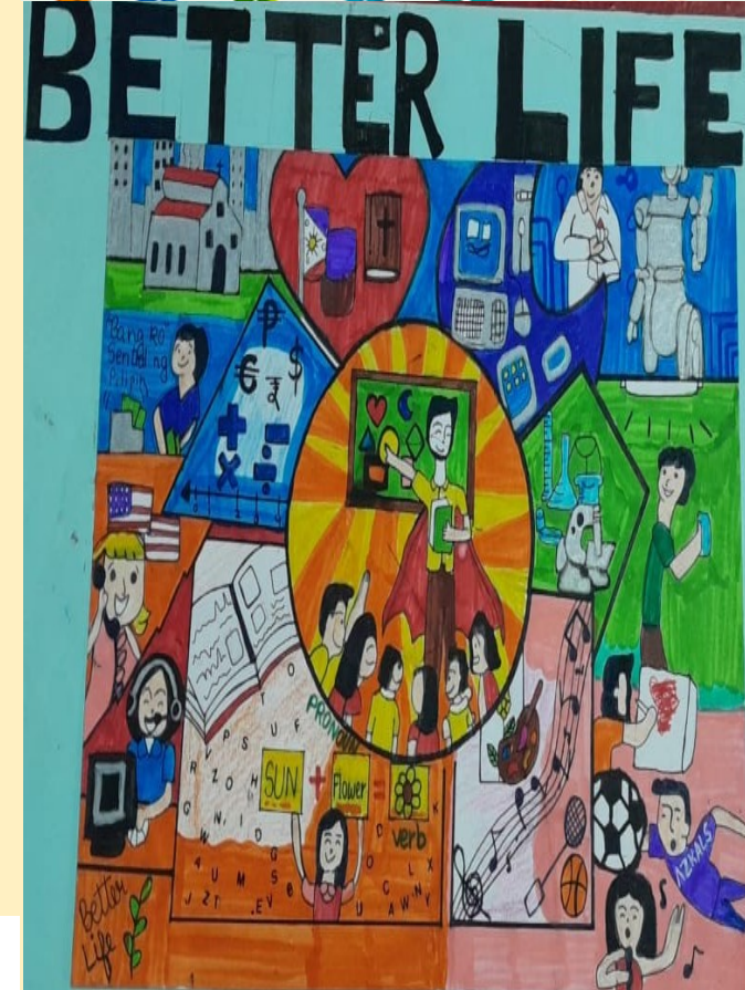
Naman VII B