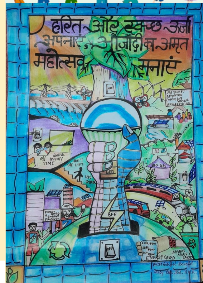
Pranjal XI Non-Medical